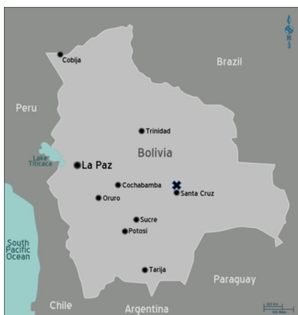
Figure 1. Location of Montero in Bolivia, South America

Montero is a small city with an approximate population at present of 135,000, having grown from a population of 15,000 in 1969. It is located in the Department of Santa Cruz, one of the nine departments in Bolivia, and is 50 kilometres north of the city of Santa Cruz in the tropical lowlands of eastern Bolivia (Figure 1). The city is organized into nine health districts, each with a health centre to serve the residents of that district.