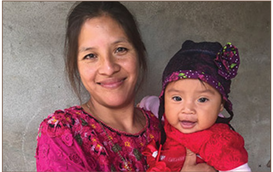
Curamericas Global helps moms ensure their babies have happy, healthy childhoods.

For Curamericas Global everyone matters. Everyone deserves access to basic healthcare services, resources, attention, and education. Curamericas Global had, has, and will continue to fight for the underserved and the most vulnerable.